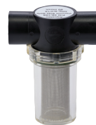
Timer and Filter included in KCPC